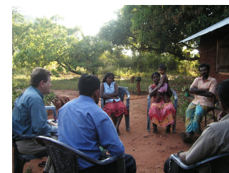
World Education strives to promote local autonomy by empowering partners to plan and implement their own programs for social and economic change