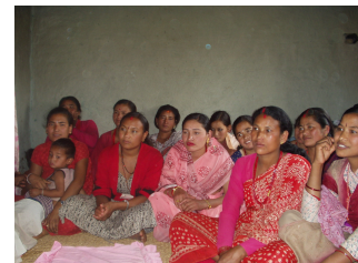
In Nepal World Education supports microfinance and literacy programs for groups of rural women

In the coming year we plan to focus on providing a wider range of program support in the developing countries in the Asia-Pacific region that we target. These are expected to be mainly AusAID-funded projects, but we also expect to work with USAID, the Asian Development Bank and private foundations. Further investment in developing systems and in building the capacity of the institution will continue in the coming period.